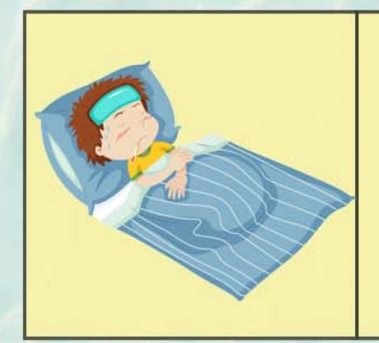
Ensure bed rest