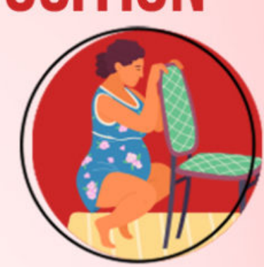
Get into a squatting position.