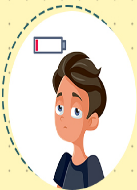
Growth Hormone Deficiency