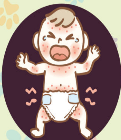
Appearance of hives