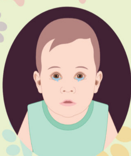
Itchy and watery eyes