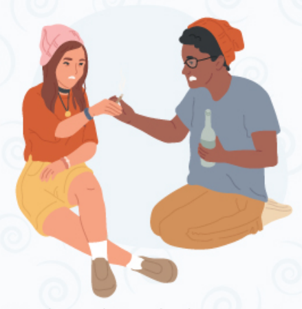
Risk of indulging in other substance abuse, such as tobacco