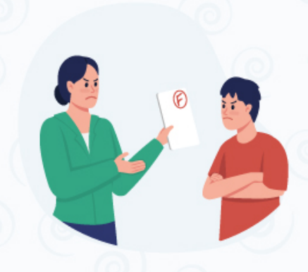
Poor academic performance and high absenteeism