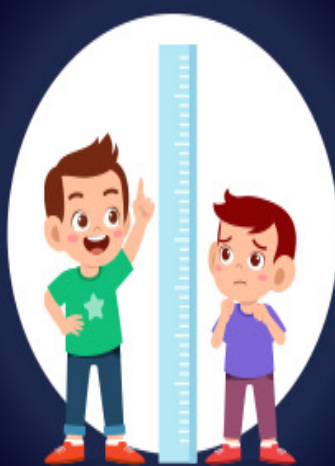
Slow physical growth than peers