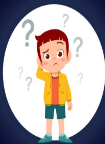
Delayed motor skills development