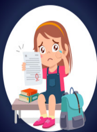
Problem with concentrating