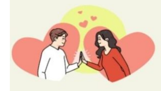
Reciprocate her body language if she is trying to get close to you.