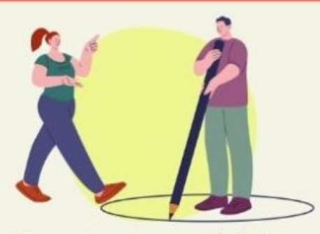
Move back or maintain distance if she's trying to get close.