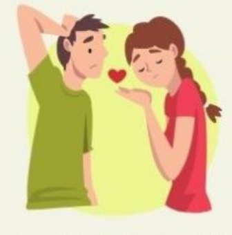
If nothing works, be honest but kind and say that you only see her as a friend.