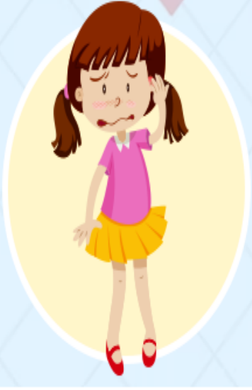
Middle ear infection