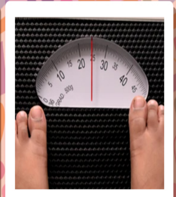
Offer the recommended amount of ORS as per their body weight.