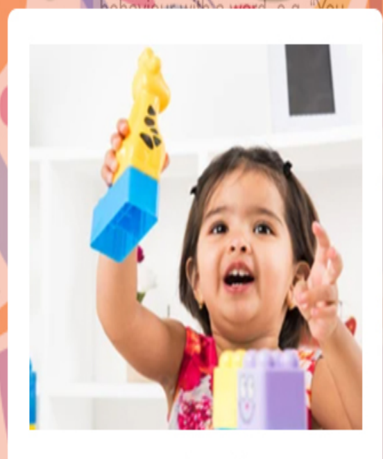
Do not let them participate in high-intensity games and activities.