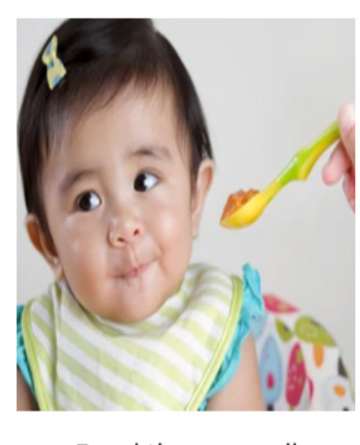
Feed them small amounts of easily digestible food, such as bananas, oats, rice, and yogurt, over short intervals.