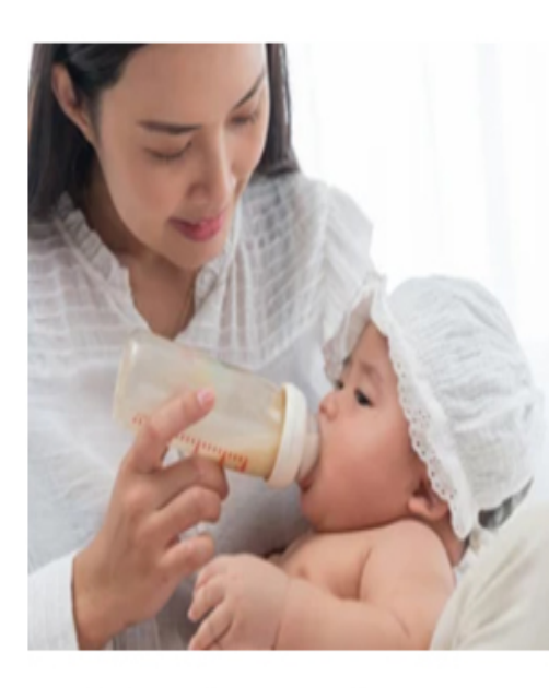
If feeding milk, give formula or breast milk. Avoid giving animal milk.