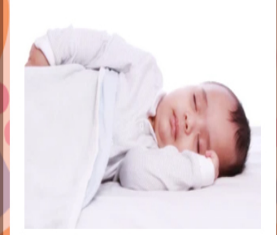
Make sure that the toddler gets plenty of rest and sleep.