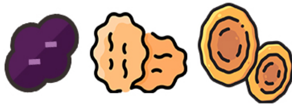
Dried fruits (prunes, raisins, and apricots)