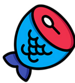
Fish (tuna and salmon)