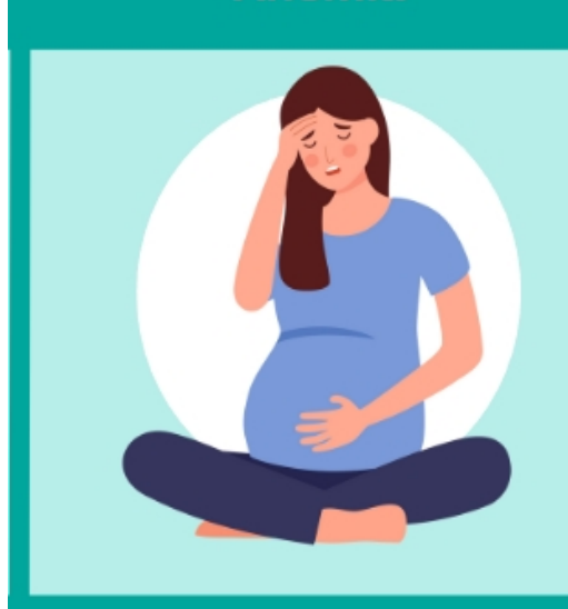
Fatigue and reduced immunity