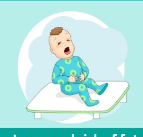
Increased risk of future health complications