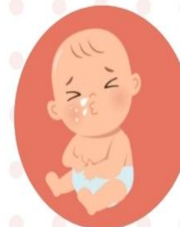
Acute respiratory distress syndrome