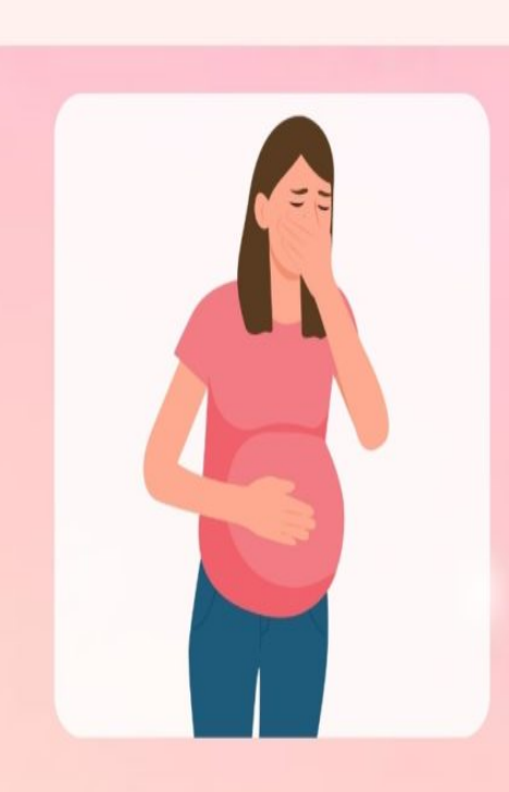
Vomiting or nausea