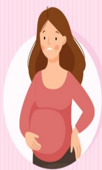
Difficulty in passing urine