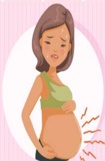
Stomach pain or cramps