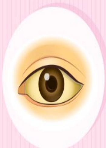
Yellowing of skin or eyes