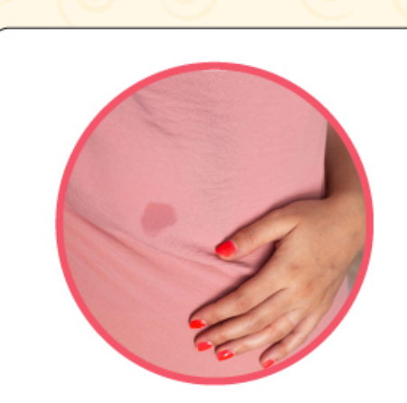
Breast milk leakage