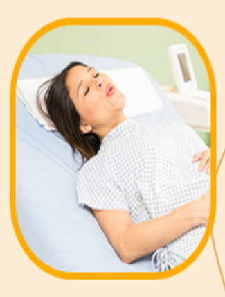
Practice breathing exercises