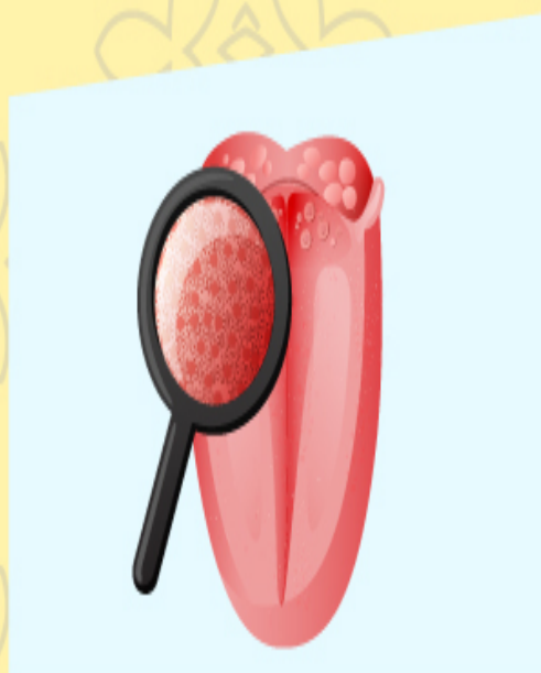
Inflammation on the tongue