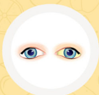
Yellowing of the eyes of the baby about three weeks after birth