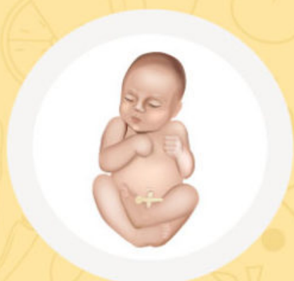
Bleeding from the belly button