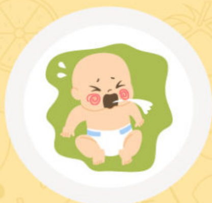
Blood in vomit