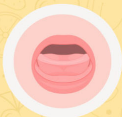
Pale skin and gums