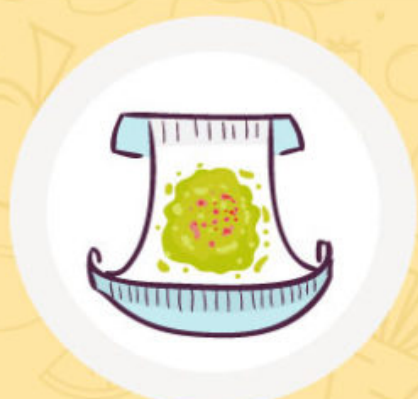
Blood in the stool or black tarry stool