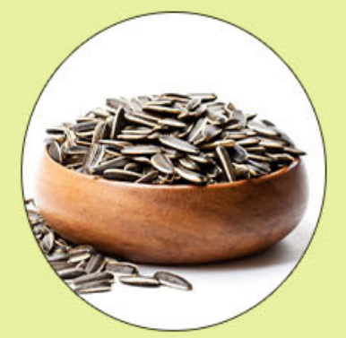
Nuts and seeds; sunflower seeds, pumpkin seeds, and almonds