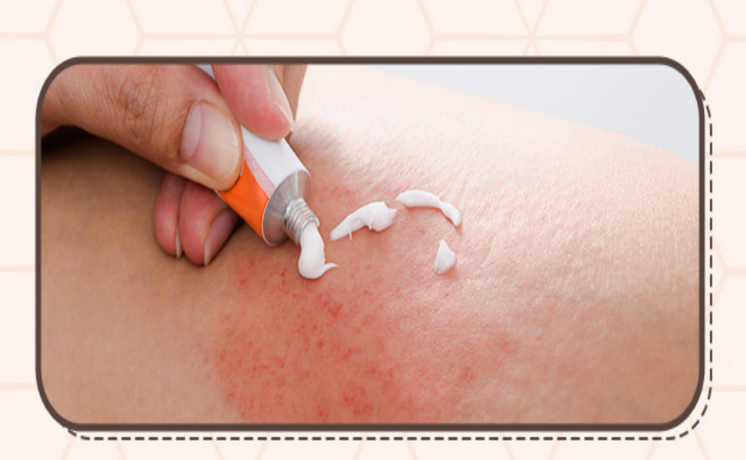
Antipruritic creams and lotions