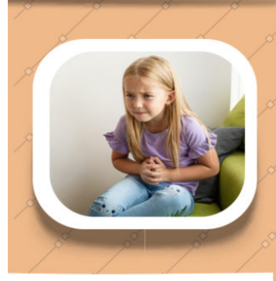
Dyspeptic symptoms, such as indigestion, belching, and bloating