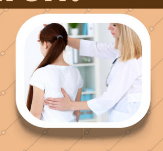
Radiating abdominal pain to the back or shoulders