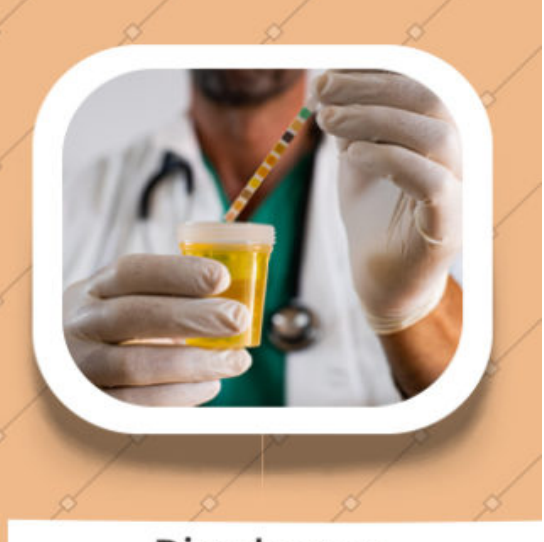
Diarrhea or light-colored stools and tea-colored urine