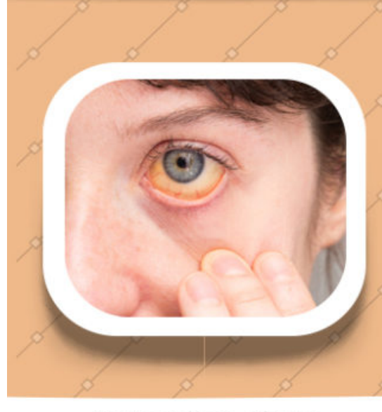
Yellowing of the skin and whites of the eyes (jaundice)