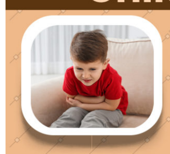
Pain in the upper right abdomen