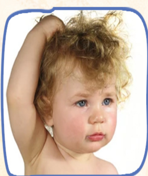
Repeated tugging of hair