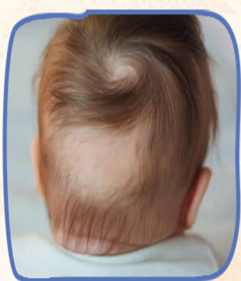
Friction or pressure alopecia due to constant friction