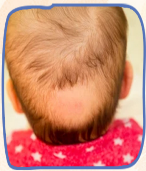
Congenital conditions, such as congenital alopecia