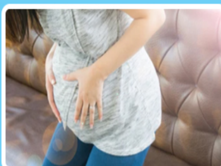
Regular or stronger contractions