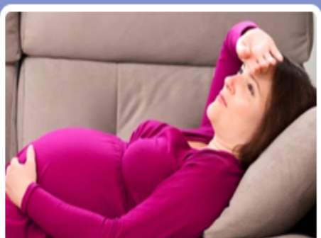
Dizziness and blurred vision