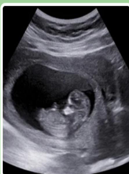
Reduced baby movements