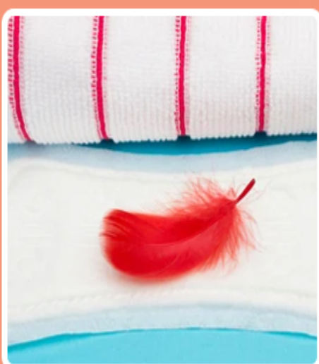
Menstruation-like vaginal bleeding