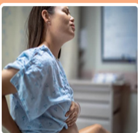
Water break (rupture of membrane)